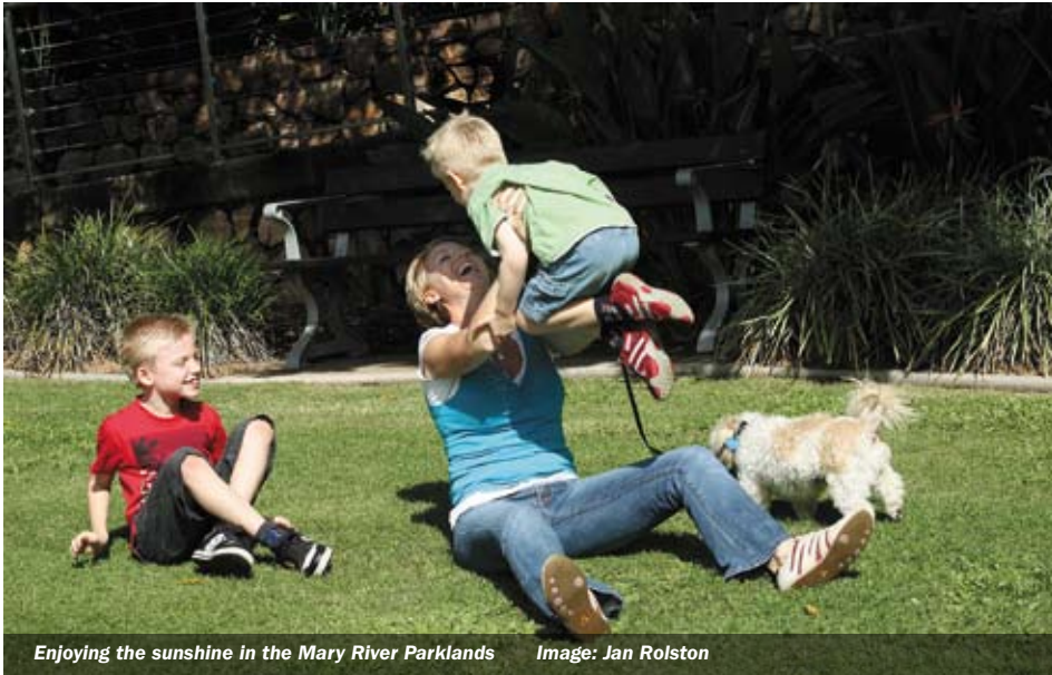
Enjoying the sunshine in the Mary River Parklands